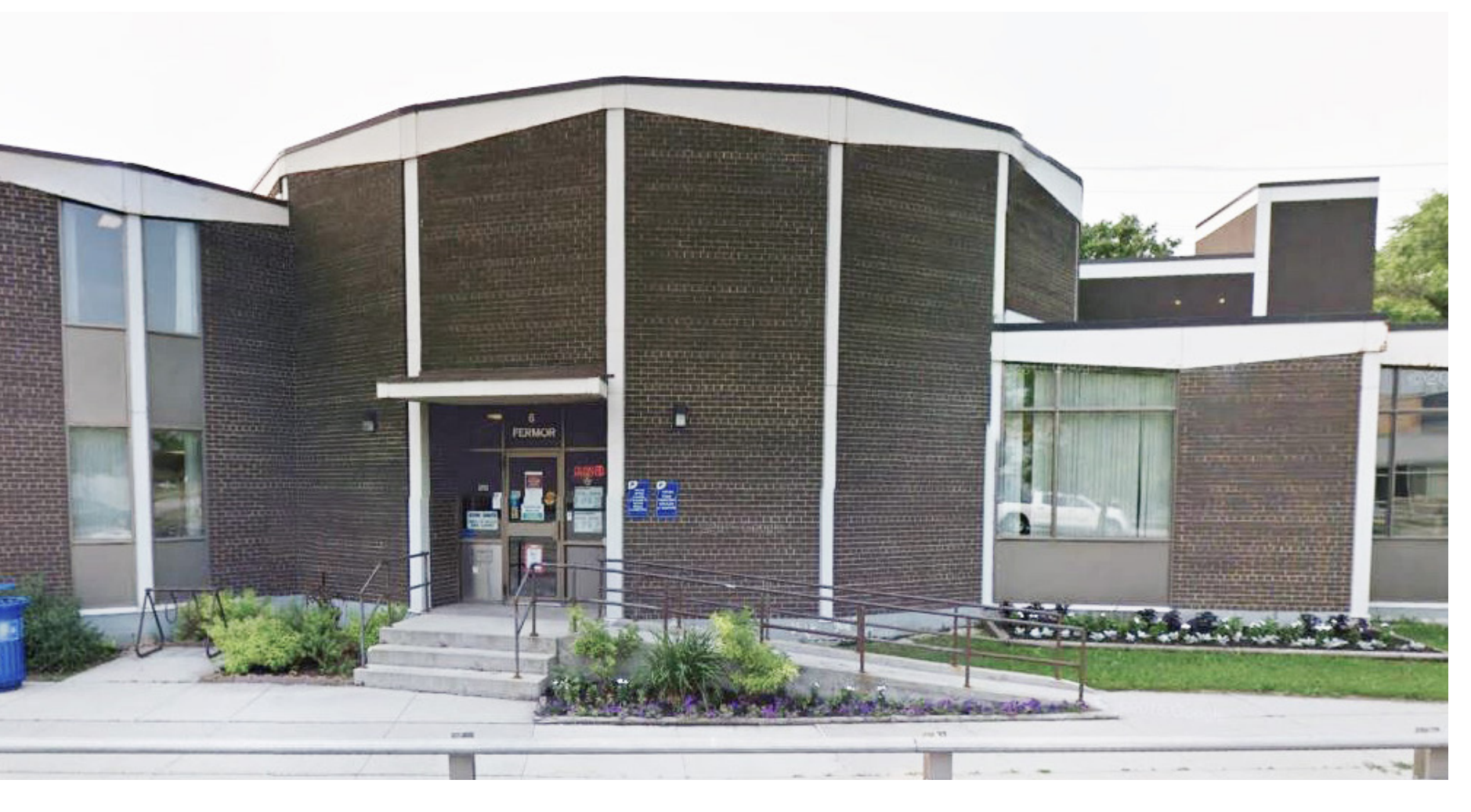
EXISTING ENTRANCE STAIR & RAMP