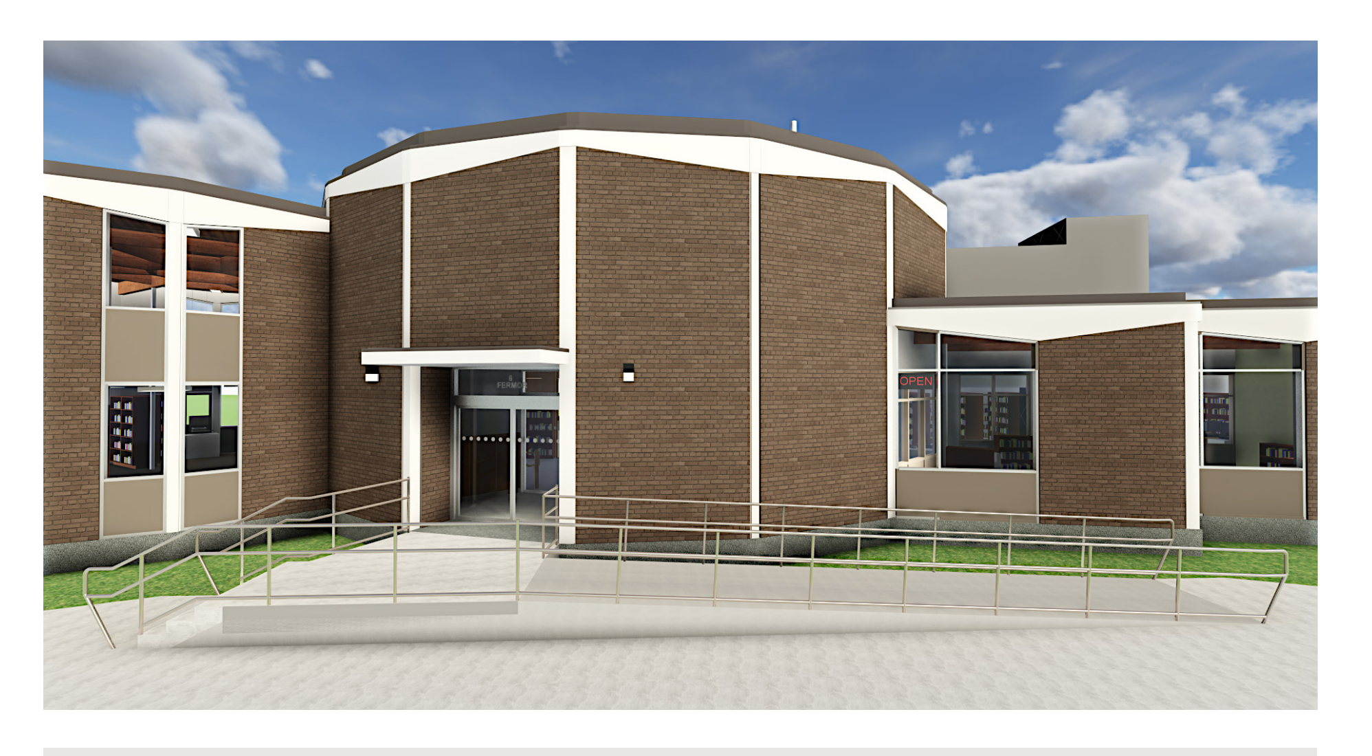
PROPOSED ENTRANCE STAIR & RAMP

St. Vital library is located at 6 Fermor Ave. across from Glenlawn Collegiate and the YMCA Winnipeg. The 2016 renovation will require the removal of the existing ramp for replacement with an accessible sloped walkway compliant with the City of Winnipeg Accessibility Design Standards.