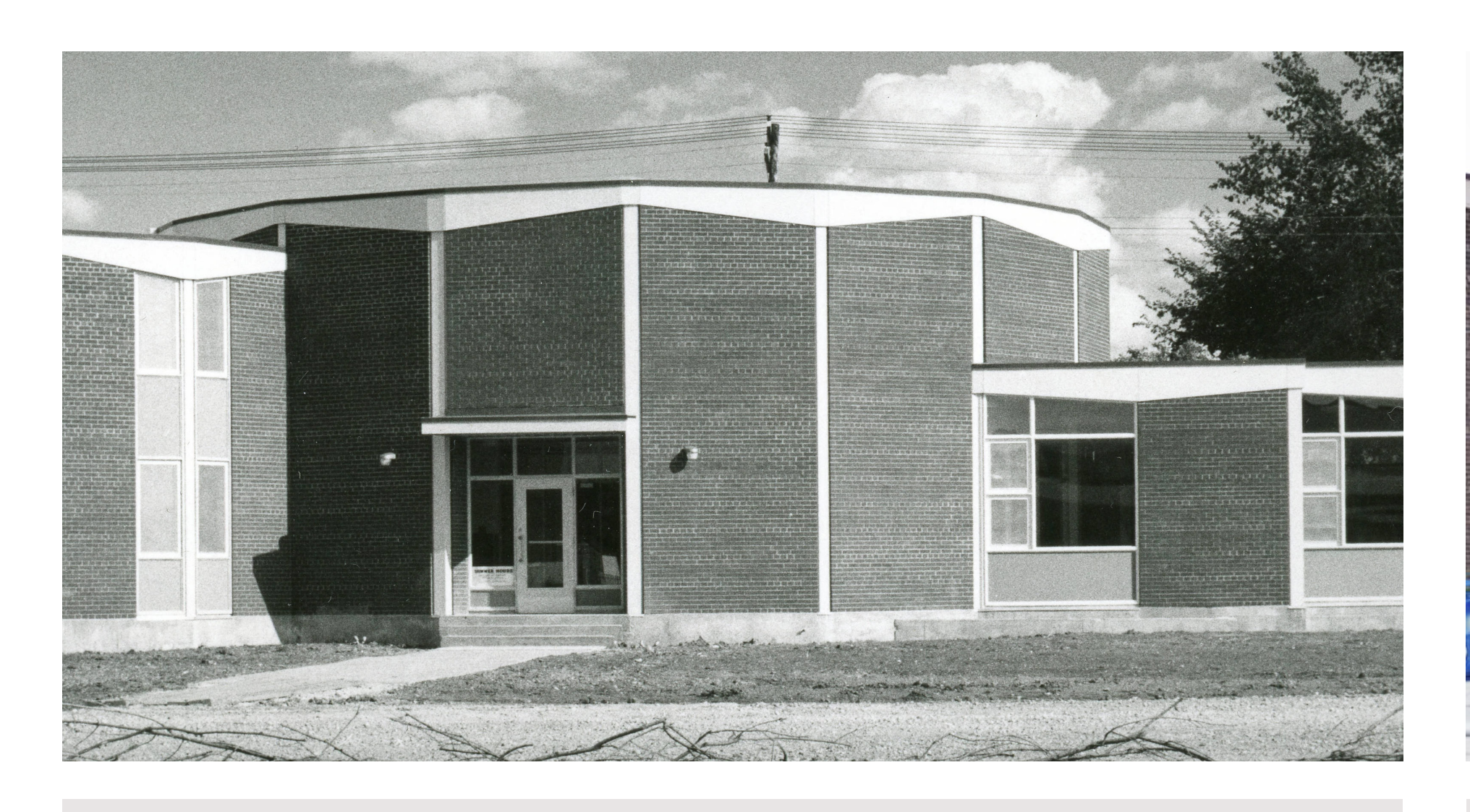
HISTORIC IMAGE OF ORIGINAL ENTRANCE STAIR